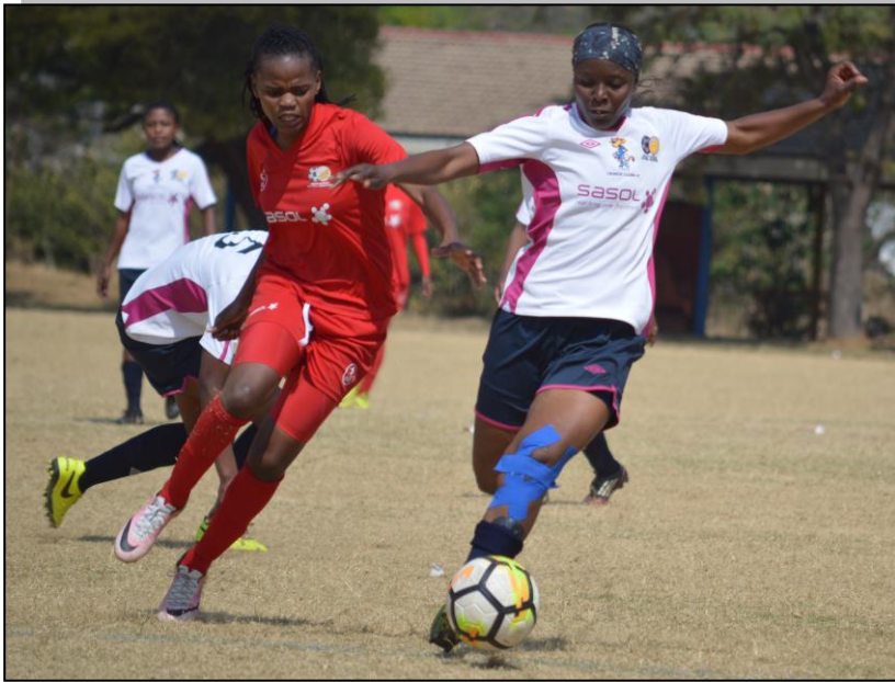
Croesus Ladies vs University of Pretoria